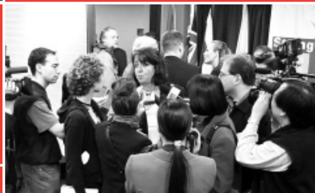
Strong Neighbourhoods Task Force